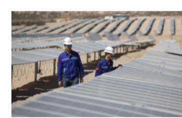
Argentina, China to conclud...