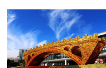
BRI participating countries...