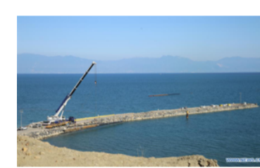
China's power plant project...