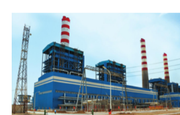
Chinese-built power plant b...