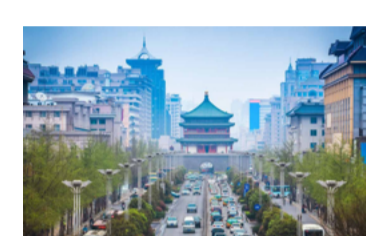
Xi'an becoming a highland f...