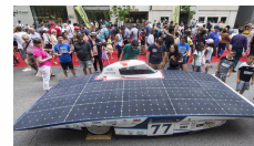
7th Annual Yorkville Exhibition Show held in Toronto