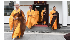
In pics: Mo Jiuhua Bud College in F