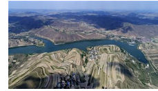
In pics: terr fields in noi China's Nin