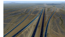
Hami section Beijing-Xin Highway expected to open at end of June