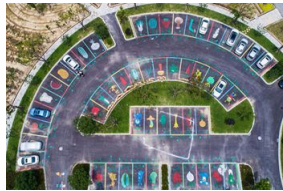
Yanglou village improves environment to build beautiful countryside