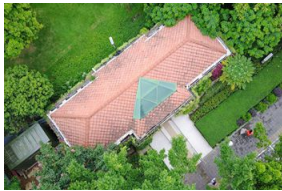
Public toilet decorated with green plants in south China's Nanning