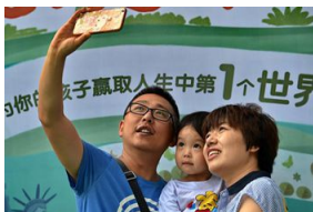
Drawing event held in north China's Shanxi