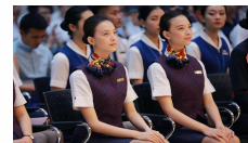
Students gr from Civil A University c