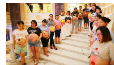
Fathers-to-be on wife's behalf mark Father's Day