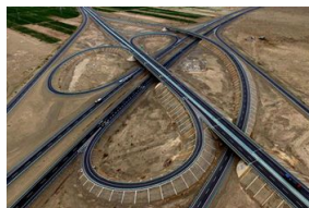
Hami section of Beijing-Xinjiang Highway expected to open at end of June