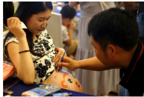
Fathers-to-be draw on wife's belly to mark Father's Day