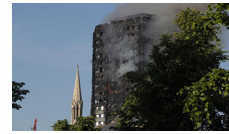
Weekly cho Xinhua pho

Cimarelli finally created a 1.5-meter-tall bronze sculpture of Matteo Ricci adorned with gilded calligraphy. The calligraphy in fact is Cimarelli's name written in Chinese characters.